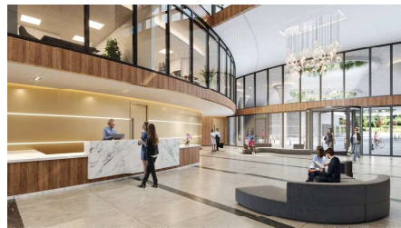
Canopy Towers 2 Lobby Rendering (Liberty Development)

Mississauga’s skyline in the process — it’s been a celebrated success.