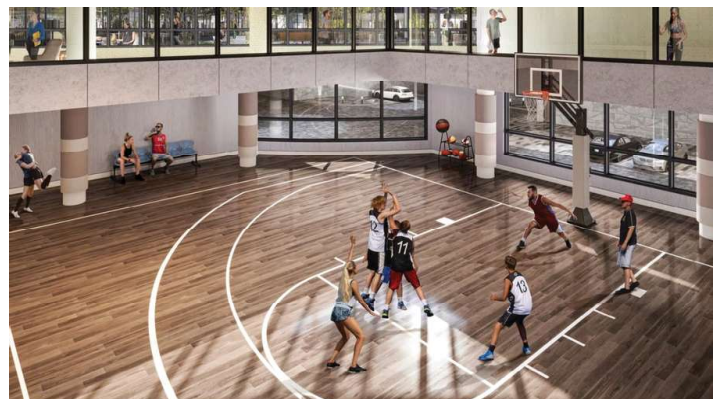
Canopy Towers 2 Half Basketball Court Rendering (Liberty Development)

This article was produced in partnership with STOREYS Custom Studio.