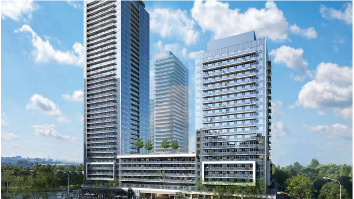
Canopy 2 Rendering (Liberty Development)