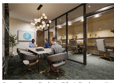
Canopy Towers 2 Rendering (Liberty Development)

The second phase of Liberty Development's Canopy Towers — aptly named Canopy Towers 2 — is swiftly taking shape, adding two more striking towers to Mississauga's skyline.